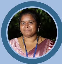
S.GangaDevi Program In-charge