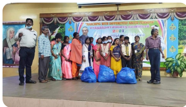
World Disability Day