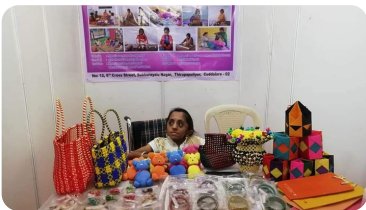
State Level Exhibition