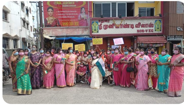
Covid Awareness camp