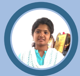
S.Baranika Program In-charge