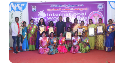
International Women Day