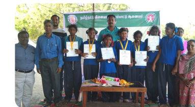
Dist. level sports