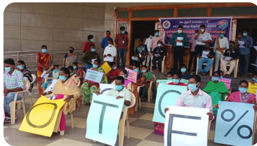
100% Voting Awareness