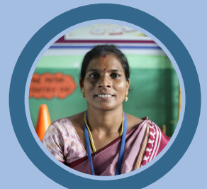
J.Ananthi Program In-charge