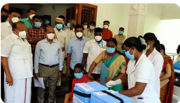
Special Vaccination Camp for PwDs