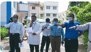
Mental Health Day