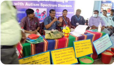
World Autism Day